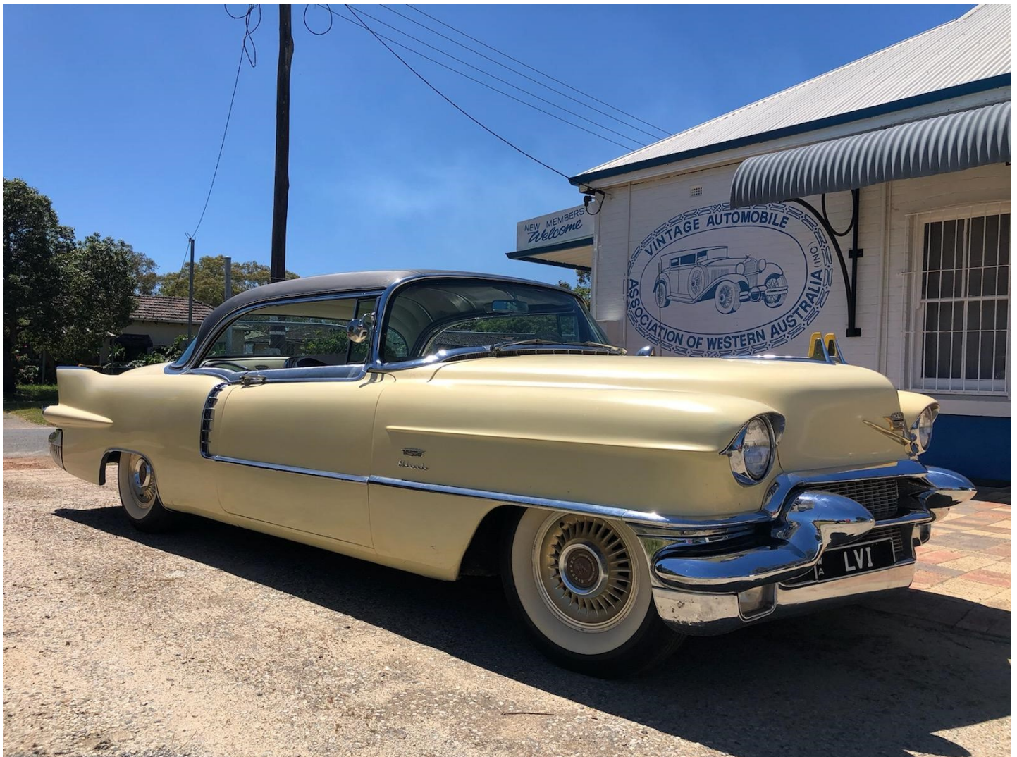
Domenic Paoliello's '56 Cadillac Eldorado Coupe