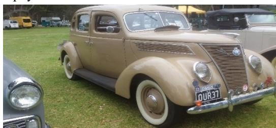
Bill Redeckis - 1937 Ford