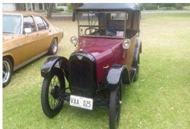
Domenic Paoliello's - 1925 Austin 7