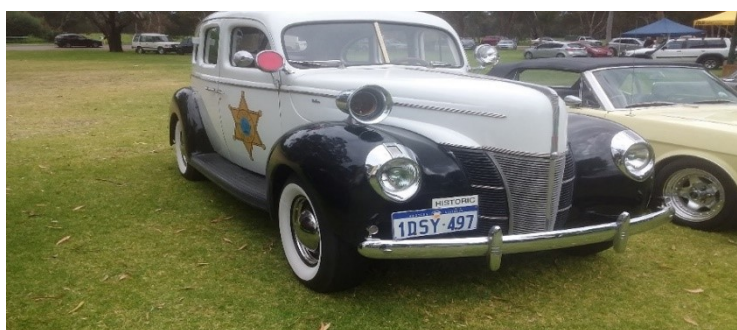
Lance Glew's - Ford